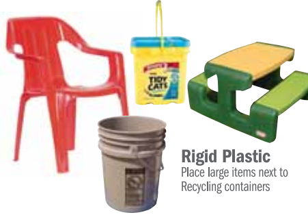
Rigid Plastic Place large items next to Recycling containers