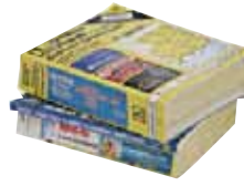
Phone Books All types & sizes